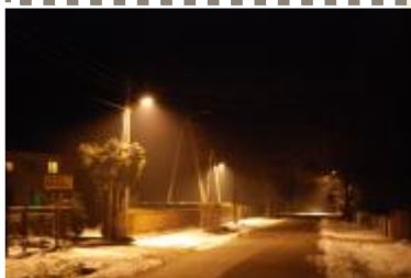
Street lamps in Palowice