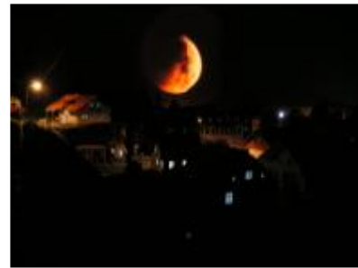
View of large astronomical mock-up "Sopotnia Wielka 2050"