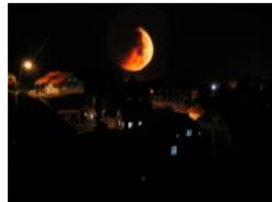
View of large astronomical mock-up "Sopotnia Wielka 2050"