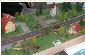
One of the three small mock-ups, it was exposed e.g. at "Science Picnic" in Warsaw