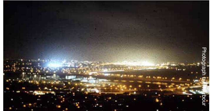
Effects of two different types sports lighting: Partially shielded lighting directed downward in Tucson, Arizona, USA (left); stadium lighting contributes to sky glow Portsmouth, Hampshire UK (right).

Paradoxically, in addition to wasting resources, a nighttime environment that is over-lit results in lowered visibility: direct glare from improperly shielded fixtures is often blinding. Light spilling into the sky does not light the ground where we need it. The redundant lighting found in many urban centers results in a clutter of lights that contribute to sky glow, trespass, and glare while destroying the ambiance of our nighttime environment. Our eyes, when dark-adapted, have good natural capacity in low-light situations. But when nightscapes are over-lit, eyes never have a chance to become dark-adapted, and areas adjacent to brightly lit areas become impenetrable, reducing safety. Some communities have experienced a decrease in crime by reducing or eliminating nighttime lighting in appropriate areas.